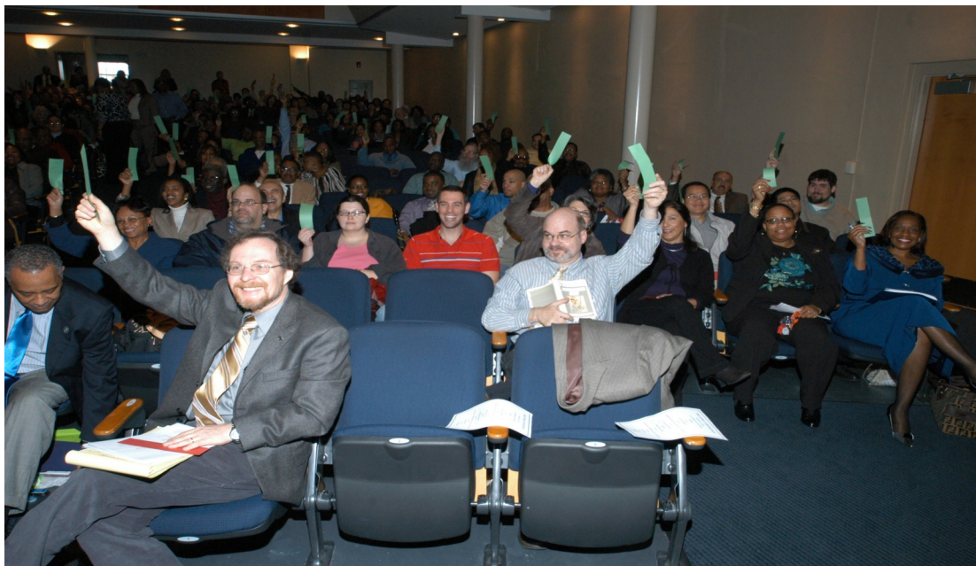
FSU Faculty, staff and administrators participate in SACS Briefing @ FSU Mid-Year Conference.

“There are 14 committees and (132) members.”