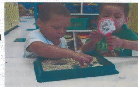
Kids prove that there is a strong relationship between science and reading!