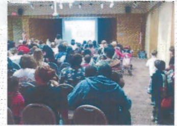
Raising A Reader PFC Kickoff October 25, 2010