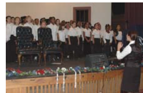
College Lakes Learning Lions Choir Performing