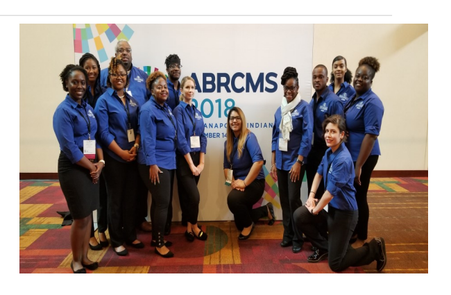
RISE Scholars attending Fall 2018 Annual Biomedical Conference Research for Minority Students (ABCRMS) in Indianapolis, IN.

Students matriculate in FSU-RISE as sophomores, although upperclassmen may be considered on an individual basis. Students who are serious about pursuing graduate study in the biomedical or behavioral research fields are strongly encouraged to apply.