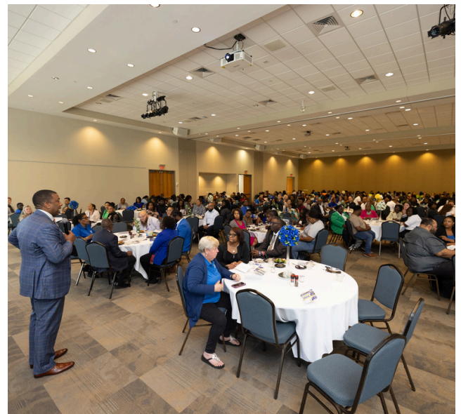
Staff Appreciation Luncheon.