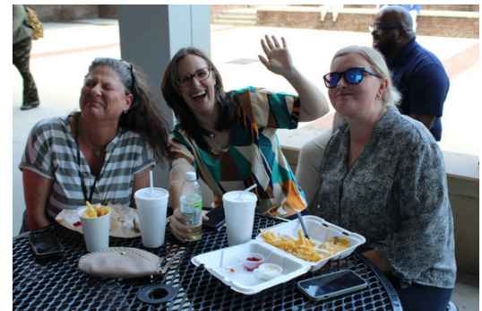
Ice Cream & Karaoke Social