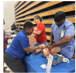
Health and Wellness Fair