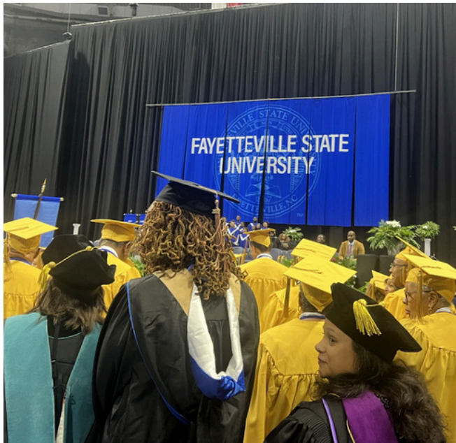
Spring 2024 Commencement