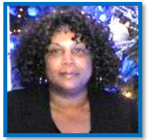
Senator Patricia Flanigan