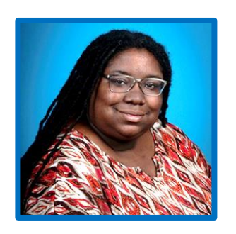
Senator Nicholle Young